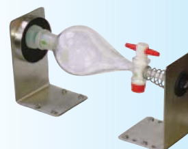
HOLDING DEVICE FOR SEPARATING FUNNELS