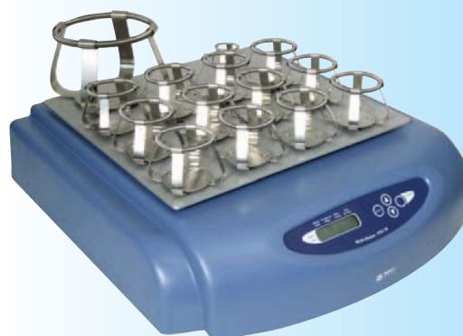
PSU-20 WITH TRAY PLATFORM