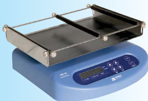
OS-10 WITH UP-12 PLATFORM