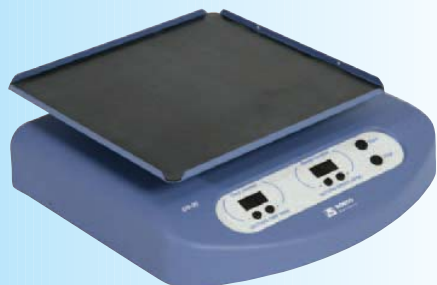
OS-20 WITH PP-4 PLATFORM